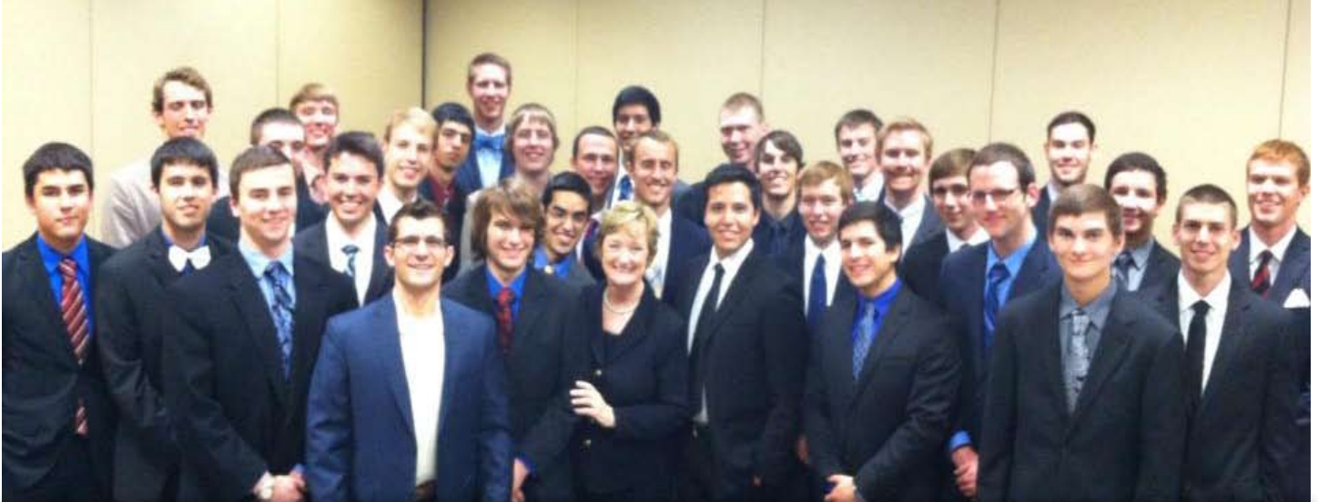
Undergraduate members with Mom Nonnie

The mentor board at AZ Beta is comprised of nine individuals who work with chapter officers to ensure superior chapter operations. The board not only includes alumni from AZ Beta, but also alumni from other SigEp chapters and higher education professionals dedicated to making SigEp the most meaningful experience on campus.